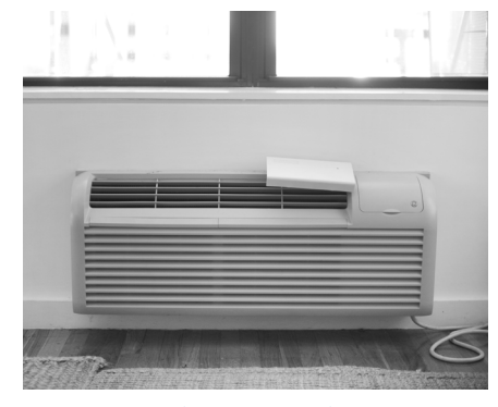
Typical PTAC (interior view)