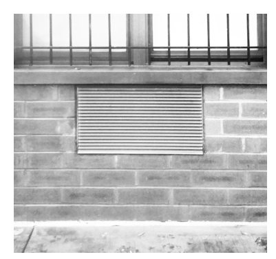
Typical Sleeve AC (exterior view)