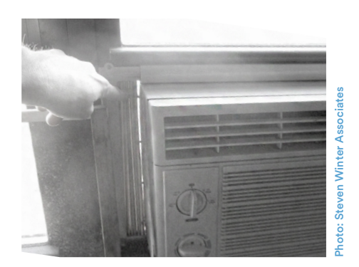
Window AC with air leak at accordion panel

Engage End Users – Staff and management should educate residents on efficient use of room ACs by providing training that includes instructions to operate each type of AC unit. Knowledgeable staff can identify poorly installed ACs as well as improper AC use and take the appropriate steps to resolve the problem.