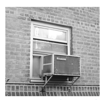
Typical Window AC (exterior view)

This tech primer will outline simple, low-cost measures and maintenance practices to ensure gaps around ACs are well sealed in order to improve efficiency, reduce drafts and moisture buildup, and maintain a consistent indoor temperature.