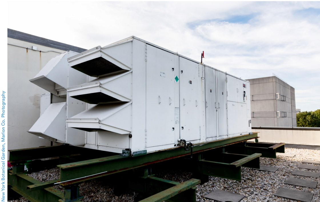
New York Botanical Garden, Marlon Co. Photography

*ratings are based on system end use, see back cover for details.