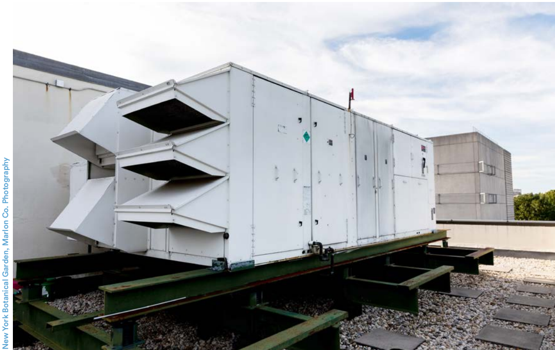
New York Botanical Garden

*ratings are based on system end use, see back cover for details.